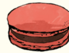
Bain de Roses Tea