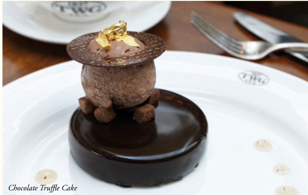
Chocolate Truffle Cake