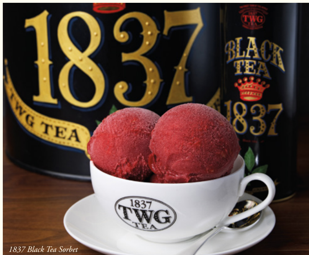
1837 Black Tea Sorbet