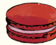
Silver Moon Tea & Strawberry