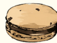
Number 12 Tea & Tiramisu