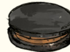
Napoleon Tea & Caramel