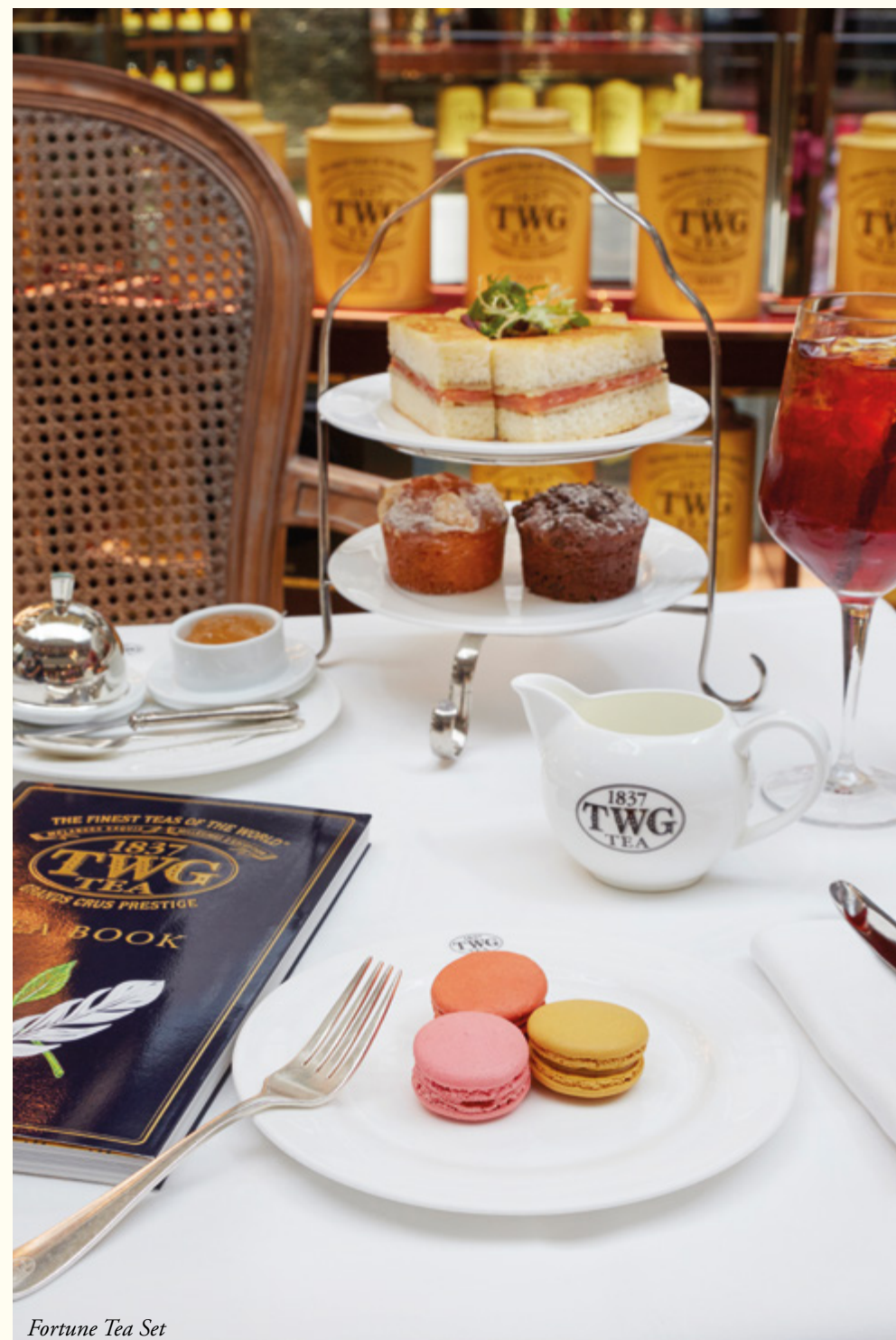
Fortune Tea Set