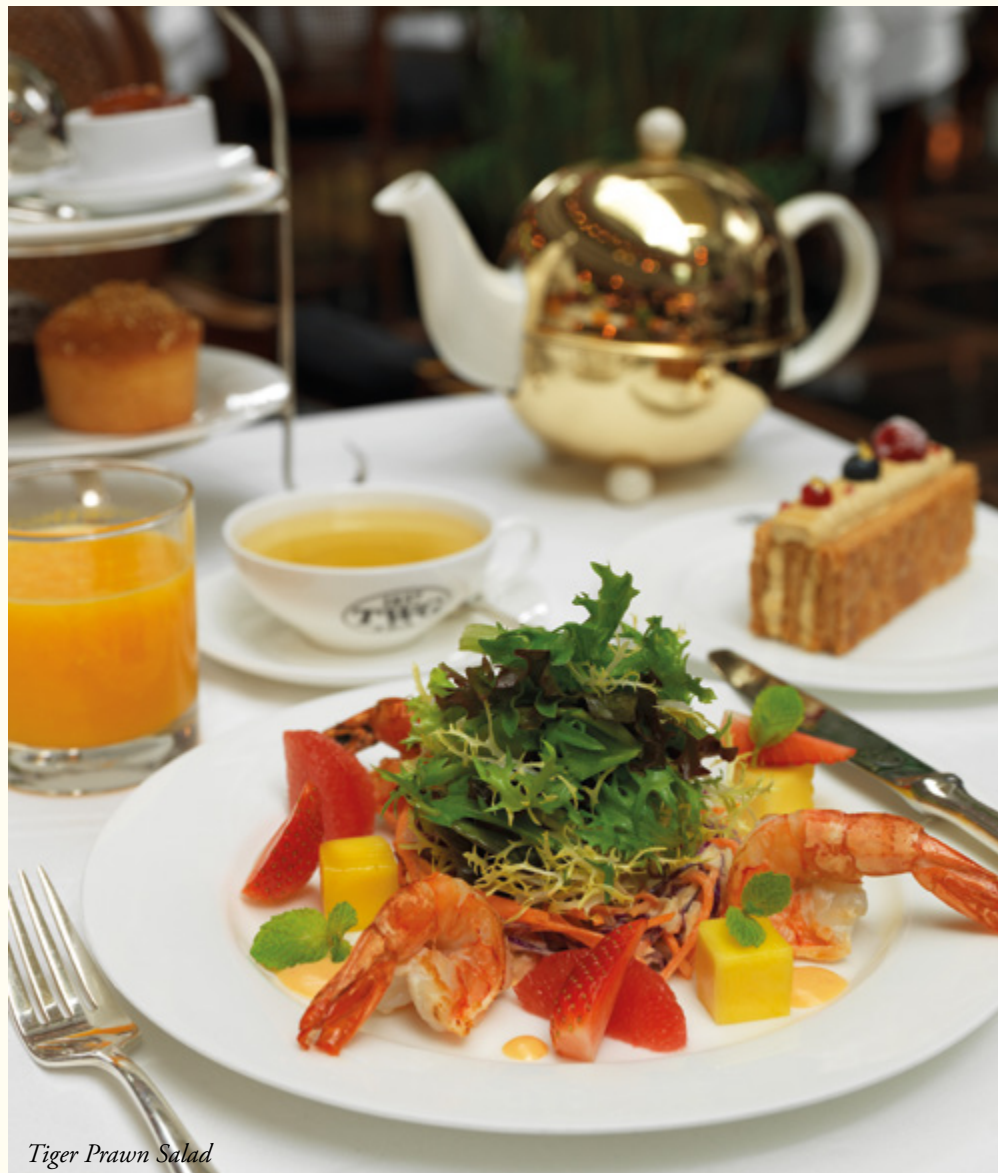
Tiger Prawn Salad

Honey glazed chicken breast and crunchy cereal topped on a bed of frisée salad with julienne of carrot tossed in a Tibetan Secret Tea infused vinaigrette, served with cucumbers, cherry tomatoes and soft cooked quail eggs.